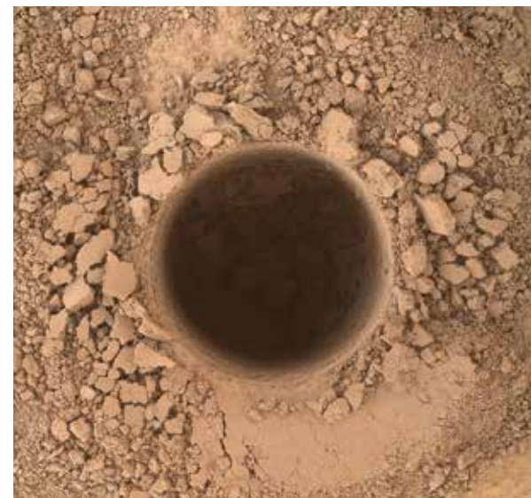
Above is the first sample-collection hole drilled in Mount Sharp, at "Confidence Hills" on the "Pahrump Hills" outcrop at the base of the mountain. Curiosity's Mars Hand Lens Imager took the picture Sept. 24 from 2 inches (5 centimeters) from the target.

Scientists are on the lookout for a key indicator of silicon, an element that is highly mobile as a chemical substance in water. Its depletion—or its enrichment—