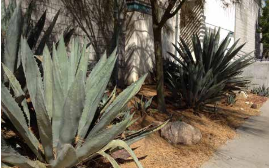
Many drought-resistant plants have been planted near Building 318.

Water conservation in Southern California is increasingly more important as seasons of drought become more severe. In fact, the current drought condition is one of the worst in California's history.